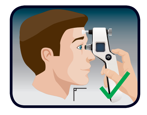
Step 1. Ask the patient to relax and look straight ahead at a specific point. Bring the tonometer near the patient's eye.