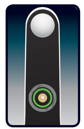
Green probe base light indication